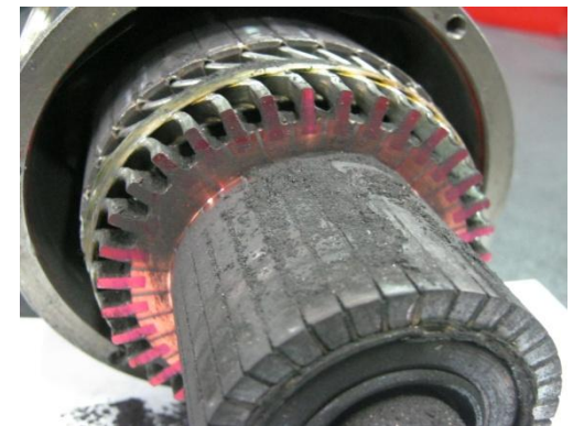
Remove armature to clean brush dust from frame with a nylon brush