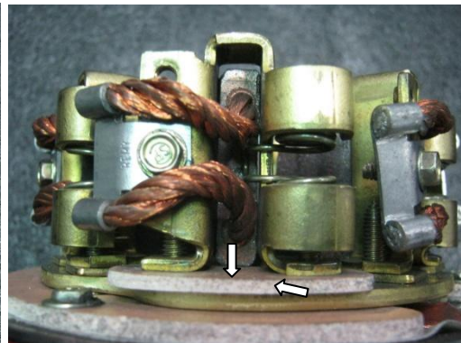
Scrape hardened chunks of brush dust from the positive brush insulators