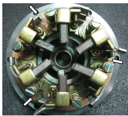
Remove three (3) screws to separate brush holder assembly from the CE frame