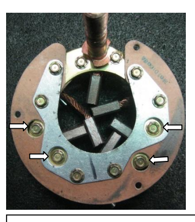
Scrape hardened brush dust from recessed screws in the brush plate