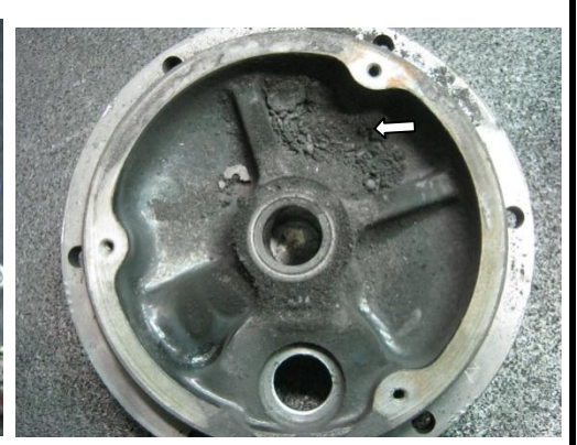
Scrape hardened brush dust from inside the CE frame, but do not scrape through the black CE frame paint coating the frame

Technical support: USA 800 854 0076, Mexico 01 800 000 7378, Brazil 0800 703 3526, South America 55 11 2106 6510 or visit delcoremy.com