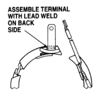
Figure 2 (This supplements CCW Rotation Illustration No. 1)